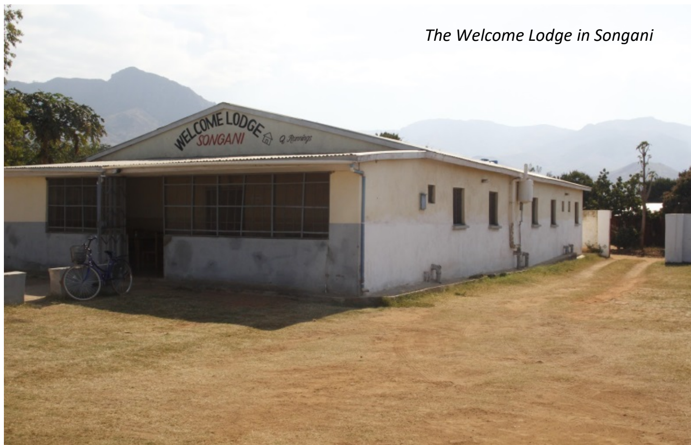
The Welcome Lodge in Songani

The school itself is 7km down a (dirt) road from the school. There are a number of ways to get to and from there. One option is to get a bicycle taxi, or njinga . They cost the equivalent of about 50p and are safe. Some volunteers choose to buy bicycles. There are charity shops in Zomba and a decent second hand bike can be bought for prices starting at around £40. There are also some bikes left at Matandani school that you could use while there that were left by past volunteers!